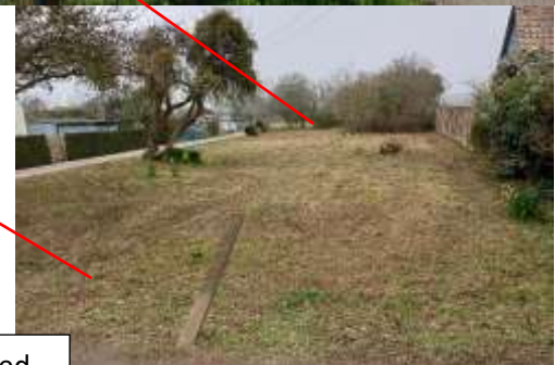
Grass cut low on 4.3.2026 + brambles and some bushes removed